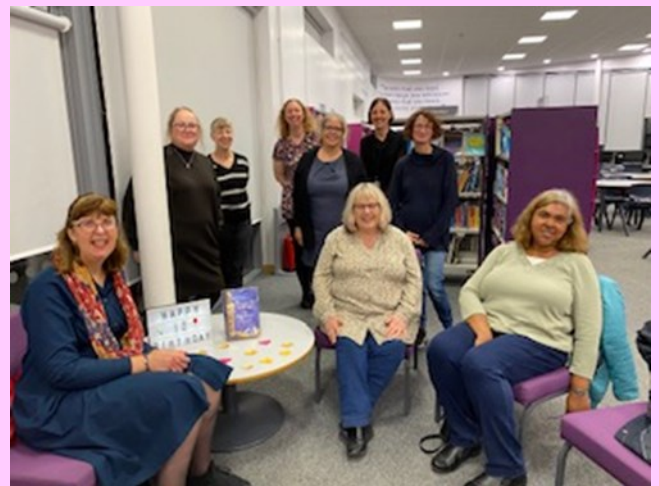
Celebrating our 10th anniversary

The next meeting will be held in the Library, 6:30pm, on Tuesday 10 December 2024.