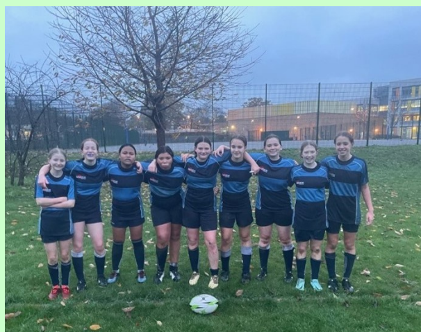
Nobel Year 9 Girls celebrating a hard-fought win