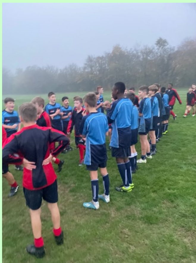
Nobel tunnel up at the end of the match