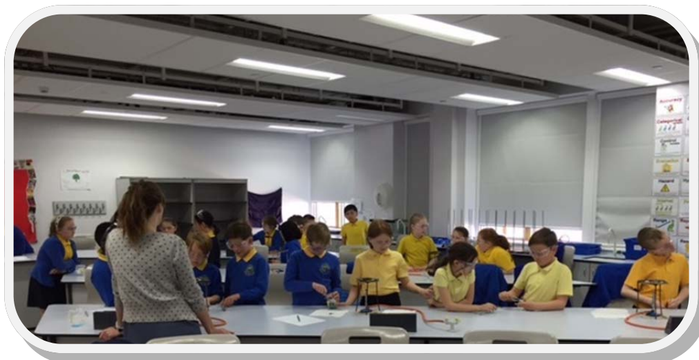
Martins Wood Year 5 getting to grips with Bunsen burners.