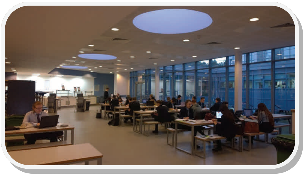
7.15 a.m. targeted revision session.