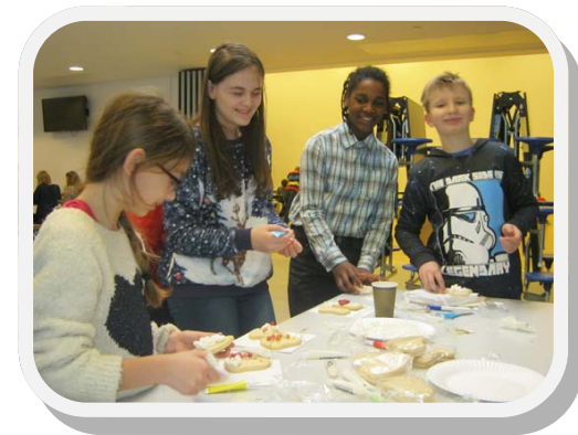
Decorating Christmas shaped biscuits